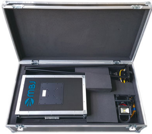
Compact and easy to use equipment